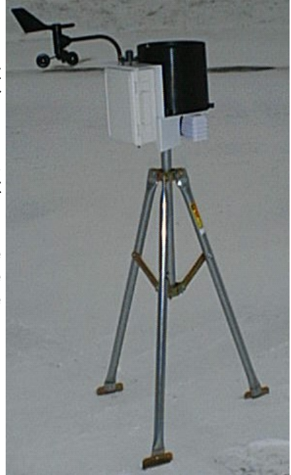
Weather Station mounted on tripod

If you are using the mounting tripod (item # 3396TP), open it and place it where the weather station is to be located. The tripod feet can also serve as mounting brackets if the unit is located on a solid surface. Slide the 3' post through both center screw clamps, adjust the height as desired and tighten the screws such that the post is perpendicular to the ground. Finally, attach the weather station to the post with the u-bolts.