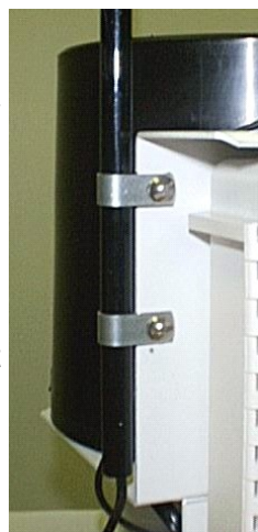
Anemometer clamped to back plate (unpainted clamps substituted for visibility)

Push the wind vane onto the top of the shaft and calibrate (see Calibrating the Anemometer p. 23 for calibration procedure).