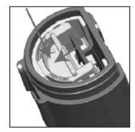
Fig. 4: Push down to lock