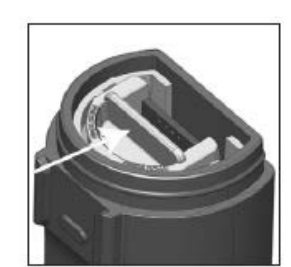
Fig. 2: Push to unlock