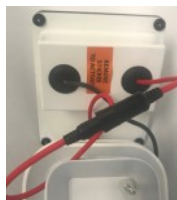
Fig. 1: Battery Enclosure

The ARS is shipped with a magnet attached to the battery pack (under sticker in fig. 1). The magnet prevents the fan from receiving power from the battery. This prevents the battery from being depleted when not in use. The magnet must be removed to allow the fan to spin overnight or during low light conditions. The magnet does not prevent the fan from receiving power directly from the solar panel. To completely interrupt fan operation, cover the solar panel, disconnect the red wire that connects the solar panel to the battery pack, and slowly slide the magnet around until you find a location that stops the fan.