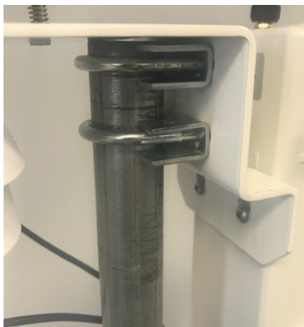
Fig. 1. Attaching U-bolt

Connect the U-bolts to the inner side of the bracket. Place the bracket over the top of the post. Attach the Pup Station to the post with the nuts (fig. 1). Do not tighten the U-bolt nuts until you have oriented the station (fig. 2).