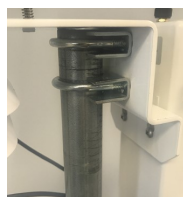
Fig. 2: Mounting Bracket

The sensor can be attached to the top of a pole or post with the included U-Bolts and bracket (fig. 2). Connect the 2.5mm plug to channel A. The solar panel should be oriented so that it is facing the sun. In the northern hemisphere, the panel should be facing south. Configure the Pup using SpecConnect web software or the PC-based Retriever and Pup Launch Utility.