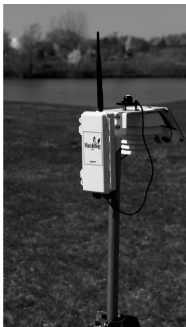
Fig. 2 Station attached to tripod