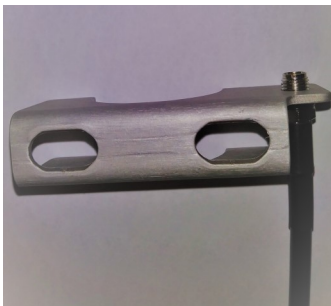
Figure 2: Cable and saddle bracket

It is advisable to secure the cable to the mounting post using zip ties or some other fastener.