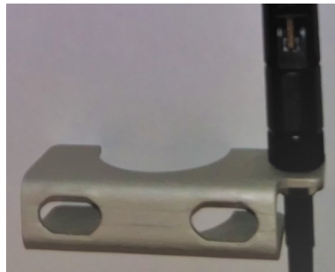
Figure 3: Antenna attached to cable