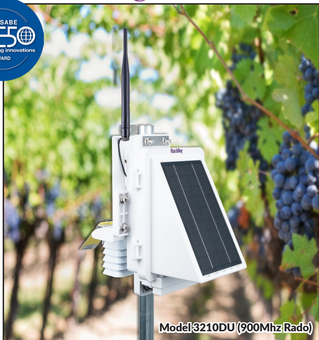
Model 3210DU (900Mhz Radio)