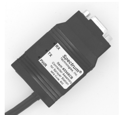
Generation 3 OK