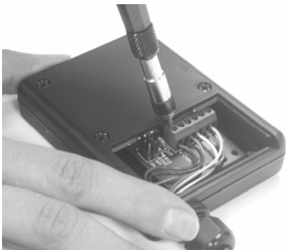
Generation 1 (note terminal strip orientation) Requires power from the display.

WatchDog Sprayer Stations manufactured prior to September 2007 were provided with first generation connector boxes which require power from both the vehicle and the display/logger device. The Sprayer Station Console (as well as certain PDAs) does not provide power, so data is not transmitted from the sensor head to the Console. Later stations were provided with connector boxes which only require vehicle power. See the images below to identify the connector box.