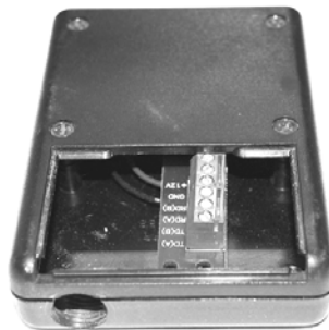
Generation 2 (note terminal strip orientation) OK