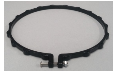
Fig. 1: Ring Assembly