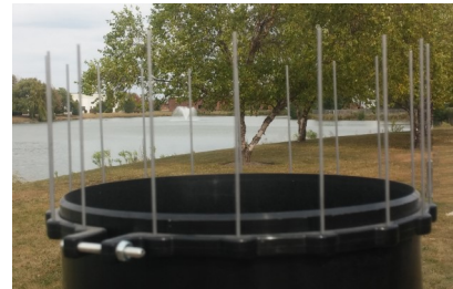
Fig. 3: Ring Attached