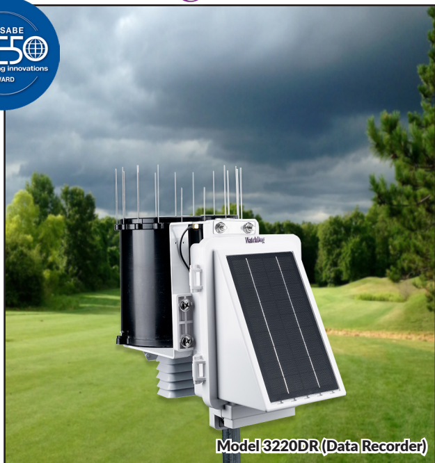
Model 3220DR (Data Recorder)